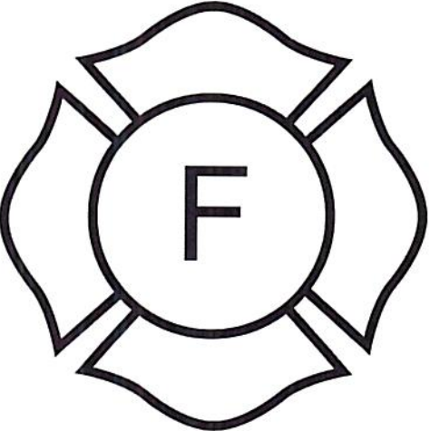
Light-frame "Floor" only