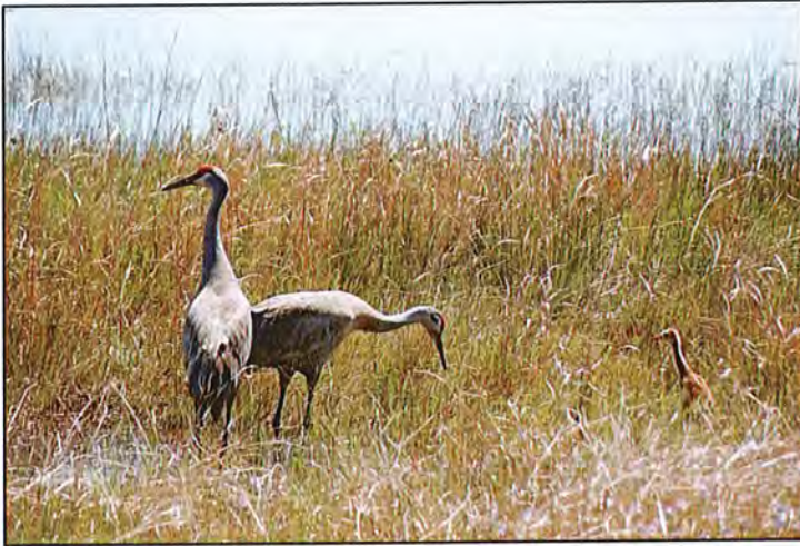
Florida sandhill cranes and flightless young.

Although Florida sandhill cranes forage in a variety of open habitats, shallow, freshwater marshes are critical for both nesting and roosting (Wood and Nesbitt 2001). Average water depth at the nest ranges from 5 to 13 inches and averages 4 to 12 inches at roosting sites (Walkinshaw 1973, 1976; Bennett 1992). Nesting and roosting locations vary from year to year due to fluctuation in water levels in wetlands across the landscape. Shallow wetlands are particularly important in supporting essential behaviors for this species.