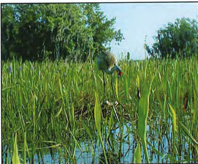
Florida Sandhill crane on a nest, FWC Photograph.

According to the Species Action Plan (SAP), habitat loss and degradation are the primary threats for sandhill cranes. Much of the remaining sandhill crane habitat is on private lands, underscoring the need to work with private landowners to reduce habitat loss and habitat degradation at nesting sites. Overgrown habitat makes sandhill cranes more vulnerable to predators, and habitat fragmentation forces sandhill cranes to travel farther between wetland and upland sites, which can lead to higher mortality. Given the importance of wetlands for roosting and nesting, changes in the timing or quantity of water can have significant consequences for sandhill cranes (Nesbitt 1996). For example, low water levels can make nests and young more vulnerable to predators and can deter breeding altogether (Nesbitt 1996). Rapid rises in water levels