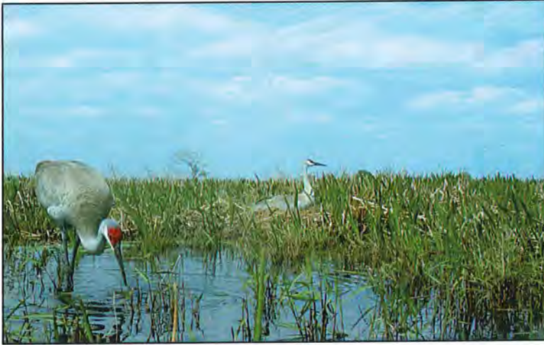
Florida Sandhill crane and mate on a nest.

Surveys from the ground are adequate, provided precautions are taken to avoid flushing nesting cranes. On small sites, one or a few observation points may be sufficient for complete coverage of the area via ground surveys. On larger areas, transects should be spaced to provide approximately 100% coverage of suitable