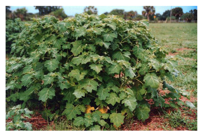
Figure 3. Mature tropical soda apple plant.

Tropical soda apple flowers throughout the year although flowering is concentrated from September through May. Fruit production is also yearly, and a mature plant will commonly have both immature