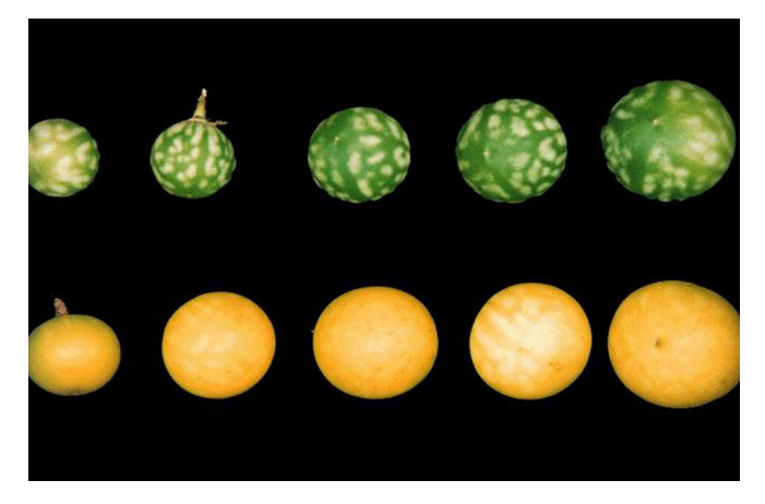
Figure 4. Tropical soda apple fruit. Top row: immature fruit. Bottom row: mature fruit.

(green fruit) and mature (yellow) fruit. Seed germination from green fruit is often similar to that of yellow fruit. Seed that is white in color is not viable, regardless of fruit color.