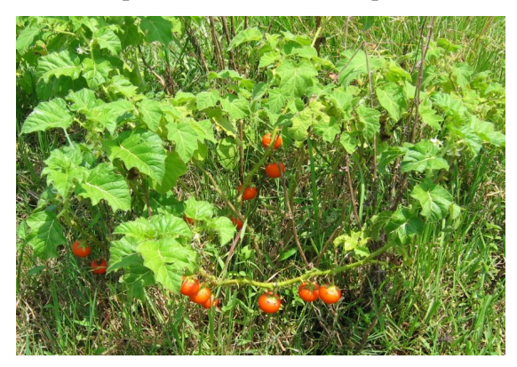
Figure 5. Solanum capsicoides, commonly known as cockroach berry or red soda apple, is often mistaken for TSA. However, Solanum capsicoides is not as common.

Solanum sp. were first reported by ranchers in South Florida in the early 1960s. However, these initial reports indicated the fruit was a cherry-red color, now yellow. Apparently, ranchers were observing Solanum capsicoides (Figure 5), not TSA. For the past 15-20 years in South Florida, TSA has been the most prevalent of those two species.